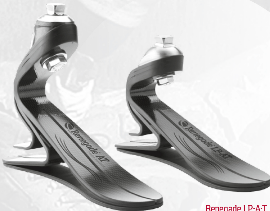
Renegade A·T (R11)