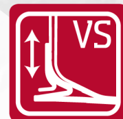
Renegade LP-A·T (R16)