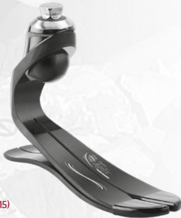
Freedom Agilix (F15)