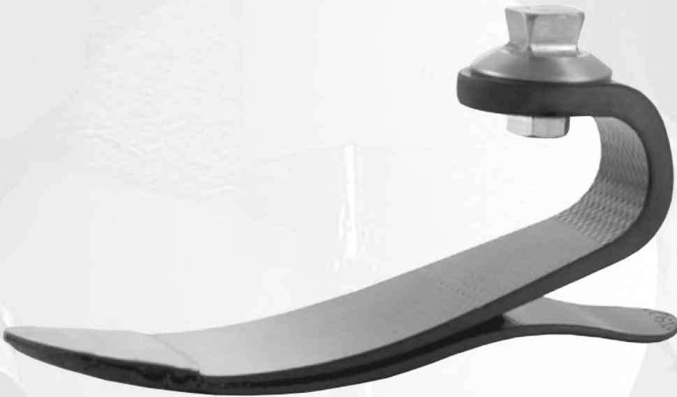
Defender Pediatric (FS3)