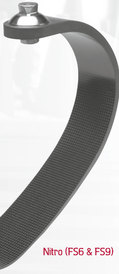
Nitro (FS6 & FS9)