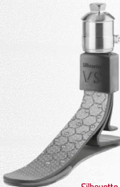
Silhouette LP-VS (R15)