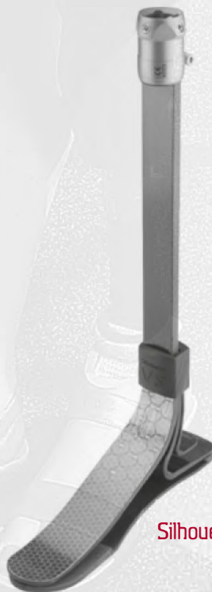
Silhouette VS (R14)