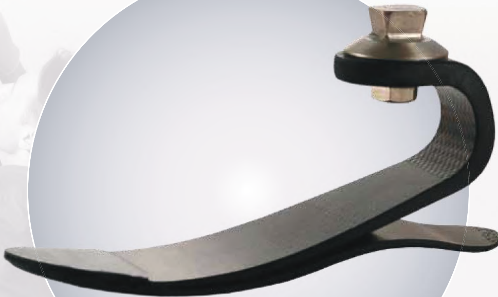
Defender Pediatric (FS3)