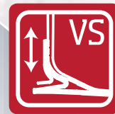
Renegade LP-A·T (R16)