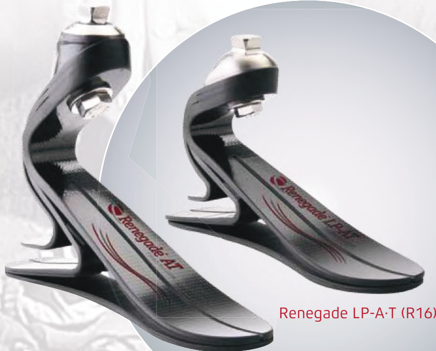
Renegade A·T (R11)