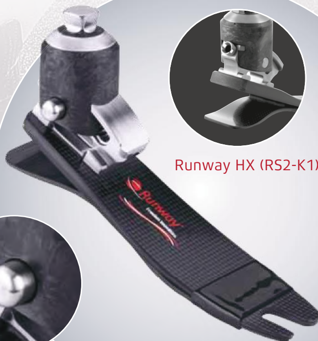
Runway HX (RS2-K1)