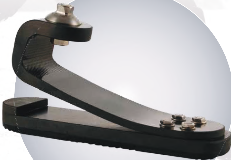
Slalom Ski (SKI)