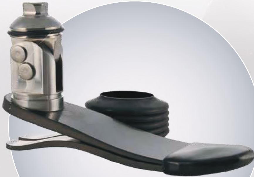
Freestyle Swim (LP2-W2)