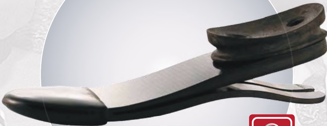
LP Symes (LP2)