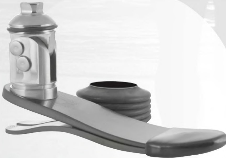
Freestyle Swim (LP2-W2)